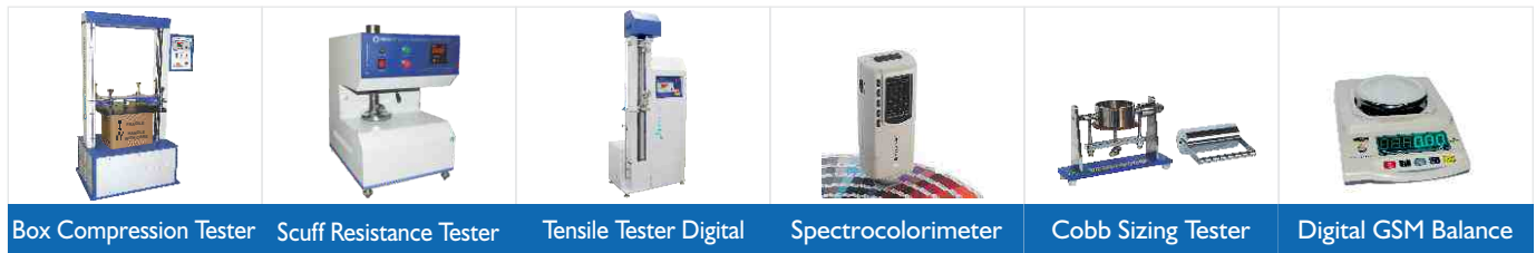
Box Compression Tester Scuff Resistance Tester Tensile Tester Digital Spectrocolorimeter Cobb Sizing Tester Digital GSM Balance