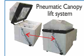
* available with only 250 liter model