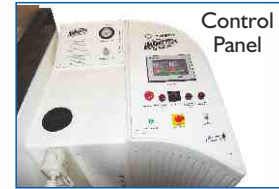
Check for options