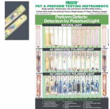
Complimentary: Preform Defect Chart

With Polariscope Strain Viewer, not only can the molecular birefringent flow lines (fringes) be seen in color but the black isoclinic lines are visible when the preform axis is parallel to the polarizing axis of the viewer